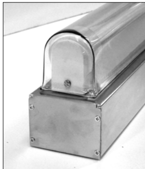
D193WP end view complete with weatherproof lens