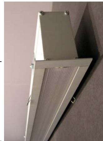
Lens or Louver

Removable end cap for continuous row mounting applications