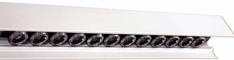
LV led D199 - 1 lamp individual replaceable Module.

Note: Any Changes or modifications to mmj lighting 96 ltd lighting fixtures, must be done in the mmj lighting 96 ltd factory. Any modifications or changes done in the field will void all warranties and approvals.